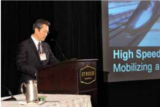
Opening Remarks by Senior Vice Minister Sumio Mabuchi