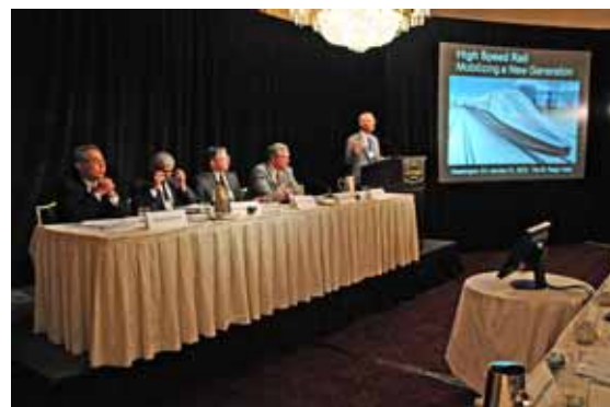
View of Panel Discussion